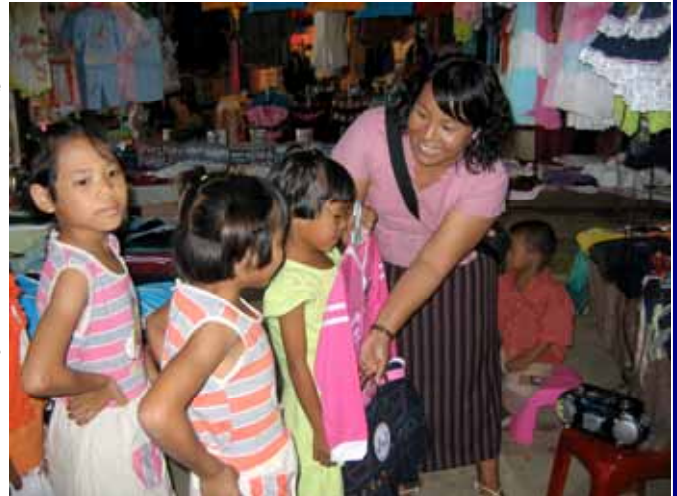
Partners thanks to you, the orphans have new clothes and winter jackets.