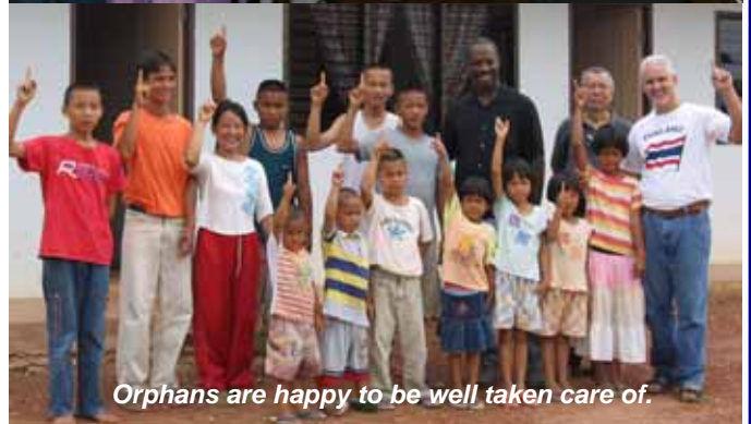
Orphans are happy to be well taken care of.

ing, "we can take this land." (Numbers 14:6-9) We are going to encourage them to go ahead and take Thailand for Jesus! We also plan to hold a large Pastors conference in Chaing Rai, and invite pastors from Fang and surrounding areas to come. We will also be holding several night crusades to evangelize the lost.