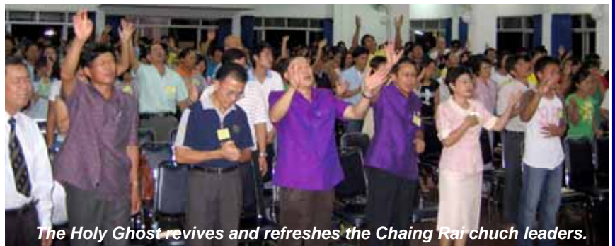
The Holy Ghost revives and refreshes the Chaing Rai church leaders.