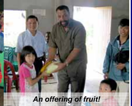
An offering of fruit!