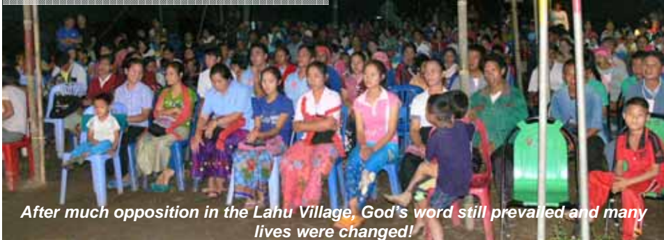
After much opposition in the Lahu Village, God's word still prevailed and many lives were changed!