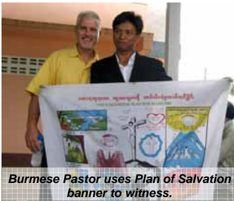
Burmese Pastor uses Plan of Salvation banner to witness.